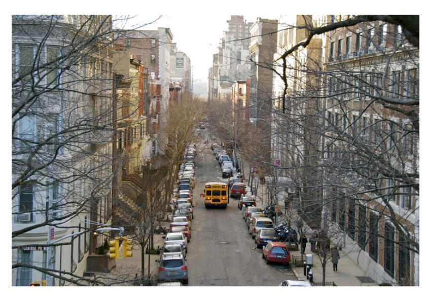
My block in New York City (West 83<sup>rd</sup> street)

I was born in New York City in 1965. (You can now figure out how old I am.) I lived in a nine-story apartment building half a block from Central Park. My brother still lives in this same apartment! When I was 18 years-old I attended college in Minnesota. After college I taught pre-school in Minneapolis for many years. I eventually made my way to Portland twenty years ago. I love to travel but Portland is my forever home.